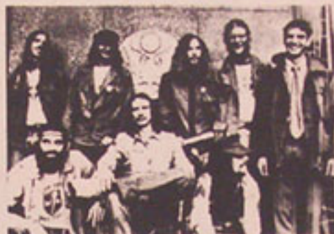
The Gainesville 8