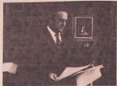
U.S. District Court Judge JOHN SIRICA ordered President Nixon to make the Watergate Tapes available to him, making way for an unprecedented battle between the American people and Nixon's battle to be decided by the Supreme Court.

When last Wednesday, August 29, 1974, U.S. District Court Judge John Sirica ordered President Richard Nixon to make available to him tape recordings of White House conversations related to the Watergate investigations, the so-called "Battle for the Tapes" grew more tense and heated. Subsequent announcements the next day by Presidential aides that Nixon "will not comply with the order" and will appeal Judge Sirica's decision only added fuel to the fire. With an unprecedented and historic Supreme Court ruling on the tapes just a few months away, mounting pressures are coming to a head and are threatening to explode.