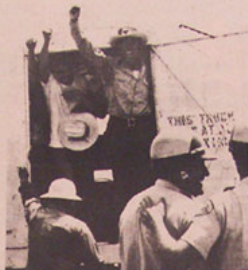
Striking farmworkers being arrested in Fresno County as cops amuse themselves.

"We sent a telegram to the Sheriff's Department demanding that we get better protection because many