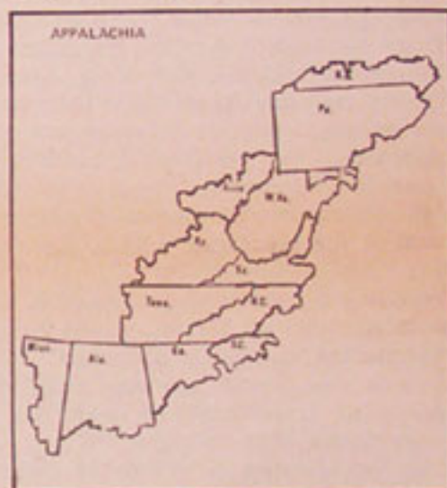
Appalachia extends across thirteen eastern states.

In Central Appalachia, Black people are invisible; according to the myth, Central Appalachia is non-racist and all-White. Being forced in many cases to live outside the city limits, perhaps the so-called experts simply missed the Black communities in their quick tours through northern Tennessee, Kentucky, and southeast Ohio.