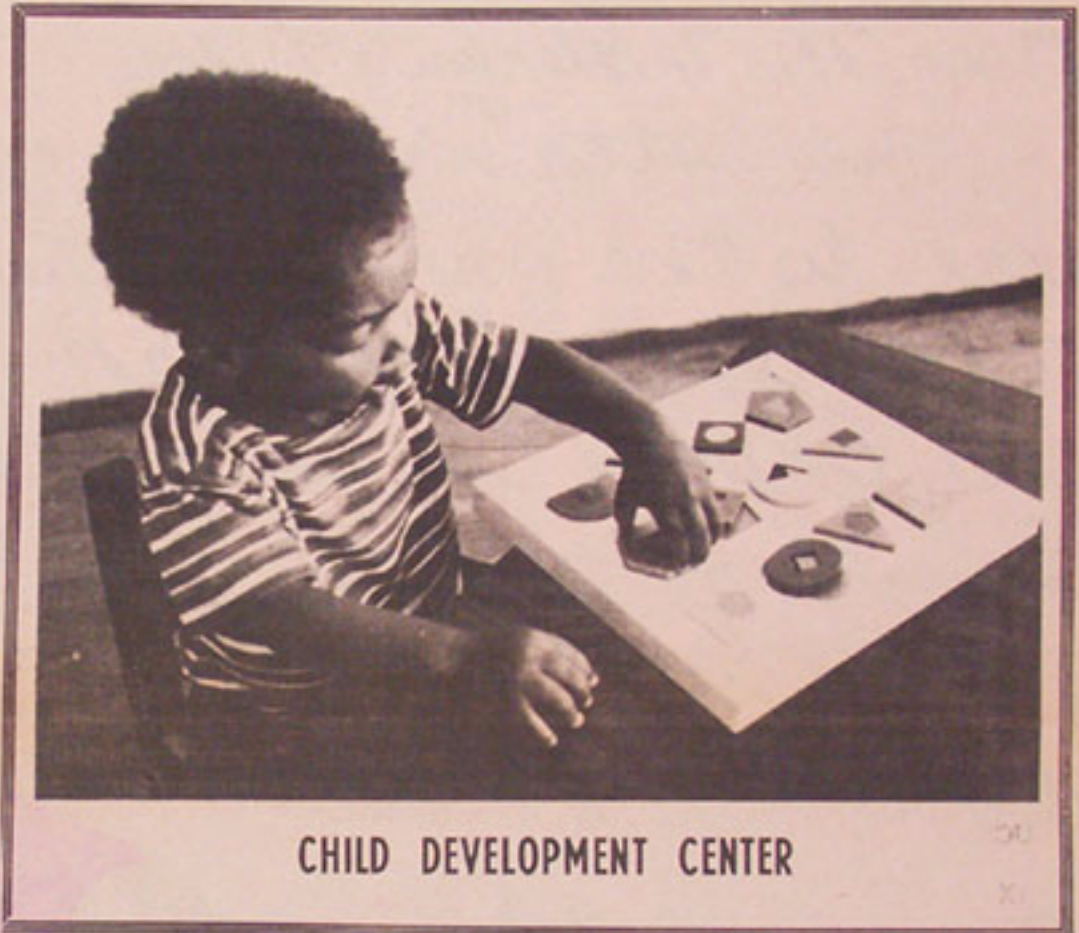
CHILD DEVELOPMENT CENTER

Provides news and information about the world and Black and oppressed communities.