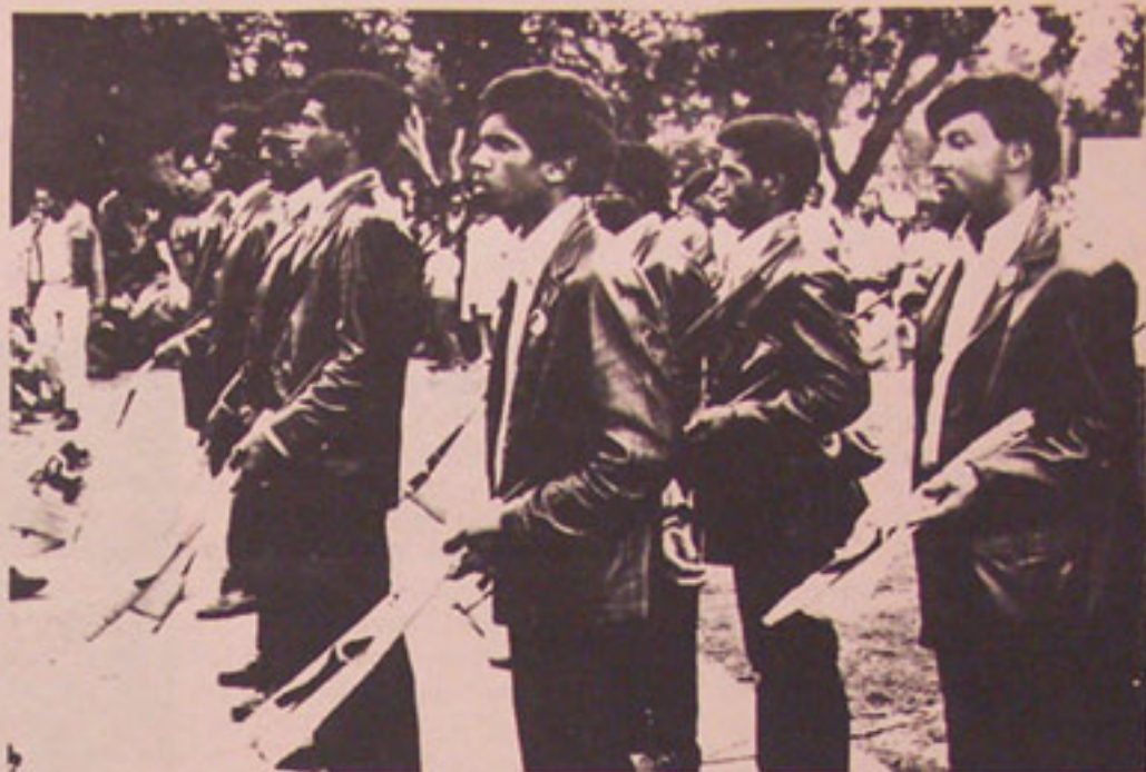
The Black Panther Party was led astray from our original vision of serving the Black community by Eldridge Cleaver. While under his leadership, people came to look upon the Party as an ad hoc military group.

Printed below is the first part of the final selection in this series from Huey P. Newton's latest book Revolutionary Suicide , that will appear in THE BLACK PANTHER . The chapter, entitled "The Defection of Eldridge and Reactionary Suicide", analyzes Cleaver's relationship with the Black Panther Party and the struggle of oppressed people. The selection contrasts Cleaver's life in the Party with the Party's vision when it began in 1966 and should clarify, for everyone, Cleaver's contradiction with the Black Panther Party and the Black community.