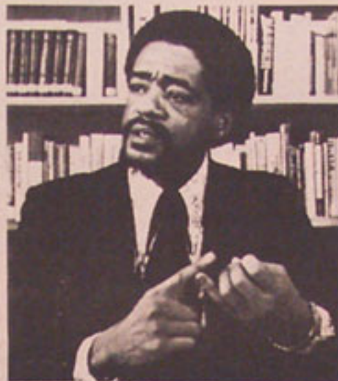
BOBBY SEALE announced the Party's challenge to racist geneticists.

3. Most knowledgeable scientists believe that the Jensen approach and conclusions are unscientific and should not focus exclusively on one racial group.