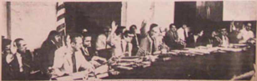
With a dramatic show of funds, the Senate Watergate Committee unanimously voted to subpoena Nixon's Watergate Tapes.

Yet, as the country waited, Nixon arrogantly refused to release the tapes. Hiding behind his twisted and wicked cloak of "national security" and the seemingly absolute and timeless lexicon called "Executive privilege", Nixon dug in and began a massive last-ditch defense of his corrupting administration: "...I personally listened to a number of them". Nixon wrote the Senate Committee, "The tapes are entirely consistent with what I know to be