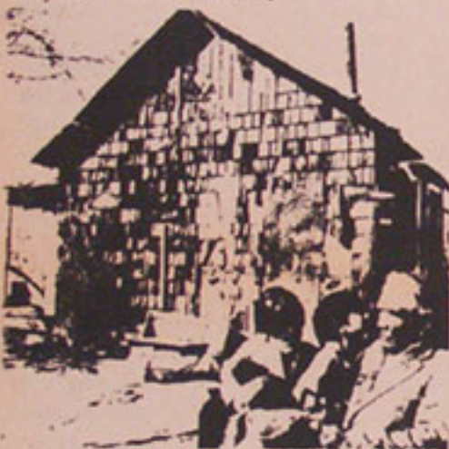
The Chiricahua Apache Tribe plans to sue the U.S. government.

(Custer, S.D.) - On the evening of August 16, the Wounded Knee Legal Defense/Offense Committee (WKLD/OC) learned that its call for a temporary restraining order against FBI harassment and brutality had been denied. The day before, two young Native Americans were attacked and bullwhipped by a former sheriff's deputy and then arrested. In another development, members of the Chiricahua Apache tribe, descendants of the legendary Geronimo, are planning to sue the U.S. government for over 27 years of atrocities.