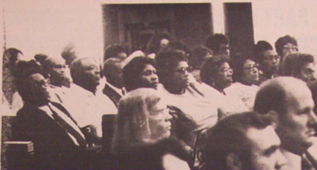
Members of the Senior Citizen's Task Force at August 22nd meeting of Dallas City Council.