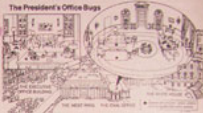
This diagram is an expert's speculation about where recording devices were placed in Nixon's offices.

Cox, on the other hand, presented a legally concise and forceful argument. "There is not the mere accusation, but strong reason to believe that the integrity of the Executive offices has been corrupted—although the extent of the rot is not yet clear." Continuing, Cox declared: "Unlike a monarch, the President is not sovereign. Like the humblest citizen, he has the legal duty to turn over evidence to a grand jury if a court determines that doing so is in the public interest." As for the "Executive privilege" and "national security" arguments that Nixon